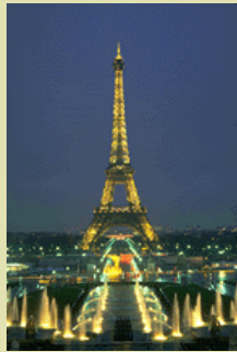
Recently evacuated because of terrorist threats. Be alert in high tourist areas.

Keep your cell phone charged and enter the emergency numbers: police, fire, your address and the nearest U.S. embassy